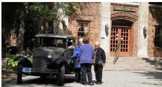
Turkey Run tour and brunch at the Inn.

Turkey Run, Marshall. The tour went through New Richmond, Alamo, and Wallace with all but a few miles on country roads. We had brunch at the Inn and were asked to park older cars around the drive in front of the Inn for other visitors to enjoy.