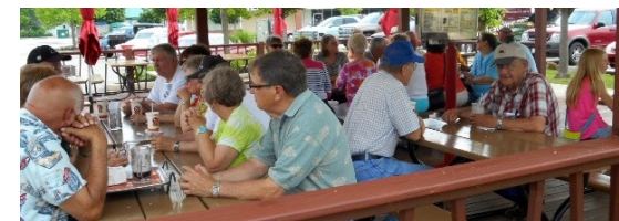
Dog & Suds

March through October we have food and conversation on the picnic tables at 4:30 PM the first Sunday of the month at Dog n Suds in West Lafayette. A short driving tour may be scheduled prior.