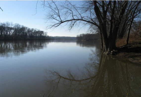
Wabash River, Fort Ouiatenon

Note: From US 231 and Indiana 25 head north to South River Road (next light) then, turn left. Drive for two and a half miles, the park entrance will be on the left, past the intersection with County Road 300 West.