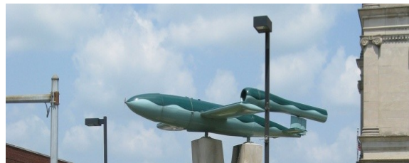
V1 rocket (buzz bomb), Greencastle

Cross covered bridge on Martin Road, then right on County Road 775 East. Turn left on County Road 720 South. Just past County Road 1000 East road takes a sharp right, crosses a bridge, then stop with a sharp left. Road becomes County Road 75 South, then County Road 100 South, pavement does get rough.