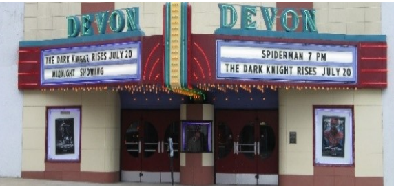
Devon Theater, Attica

Road ends at County Road 1400 North then, turn right. Continue through Riverside. In Attica road becomes North Perry Street.