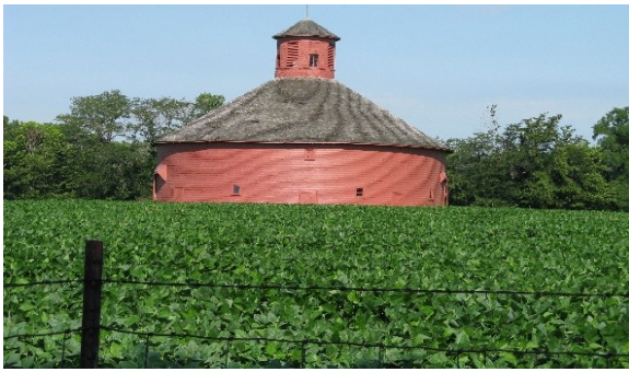
W. H. York Round Barn, Lodi

Round barn will be on your right. Continue south and turn right on County Road 700 West, then left on County Road 1025 North. At Towpath Road you will make a jog to the right and left and be on County Road 1025 North. Turn right on County Road 425 West, then right on County Road 900 North, then left on County Road 525 West, finally at Towpath Road turn left and head south again.