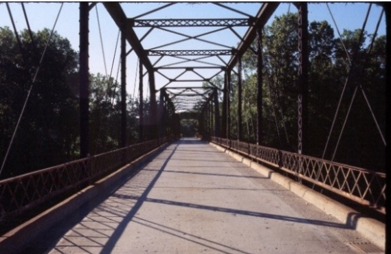
Granville Bridge, Granville

From the fort turn left onto South River Road.