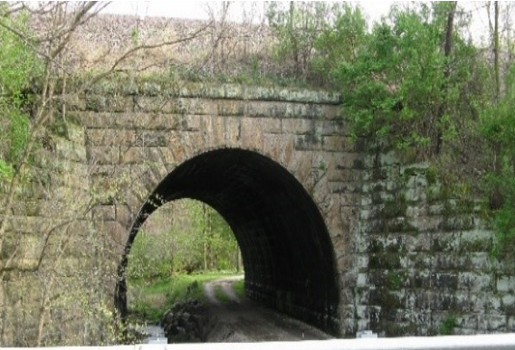
Railroad viaduct over Grindstone Creek, Riverside

Turn right on Coolidge Road. Turn right on Turner Road. Road becomes West County Line Road. Then, becomes County Road 1500 North. Turn right at railroad track crossing onto East Flint Road.