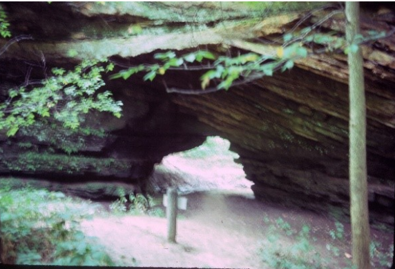
Portland Arch, Fountain

Continue through town, road becomes Xavier Road/County Road 30 East. Turn right onto County Road 860 North then, left onto County Road 70 West then, right on County Road 650 North and head west to Fountain.