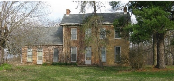
Peter Weaver House, West Point

Turn right on County Road 300 South. Road becomes Burton Road. You will go past the Peter Weaver house, one of the early settlers in Tippecanoe County.