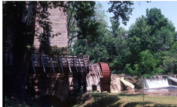
Mansfield Mill, built 1839, Mansfield

Continue south to Bridgeton. 2:50 PM, 10 mi, 20 min, leave 3:00 PM. We can stop here and stretch our legs. In Bridgeton turn left onto Hawkins Road then, left onto Mansfield Road. Cross over Indiana 59 into Mansfield. Will have a stop here to see the mill.