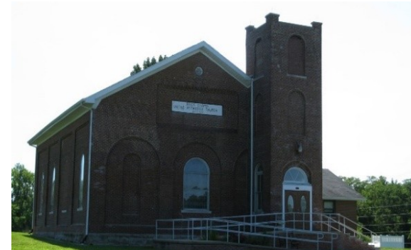
United Methodist Church, Brick Chapel

Return to Lafayette by taking US 231 north. About five miles north of Greencastle is Brick Chapel. There is an interesting cemetery here with unusual gravestones.