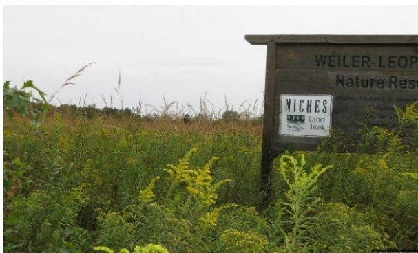
Weiler-Leopold Nature Reserve, Independence

becomes Independence Road heading west and south to the town of Independence.