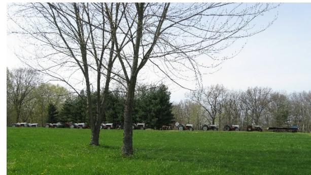
Tractor Collection, Fountain

Road zigzags a couple times then ends at County Road 650 North, turn right going to Fountain.