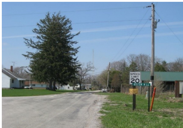
Downtown, Green Hill

Start at McDonald's south side. Head west on Indiana 25. Turn right onto US 231 then, turn left onto South River Road.