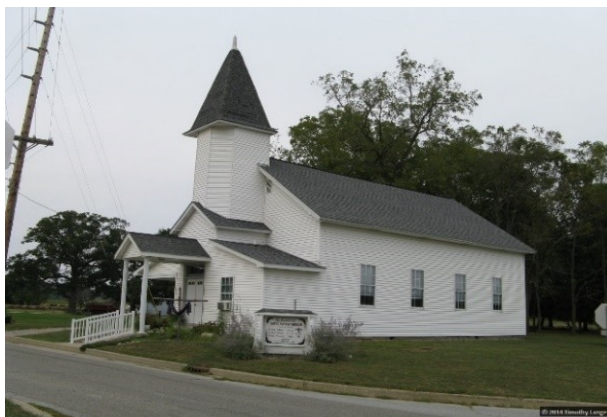
United Baptist Church, Independence

The Weiler-Leopold Nature Reserve will be on the left side after a sharp right turn in the road. The nature reserve is located four miles south of Green Hill and three miles east of Independence and is one of the Niches parks. Website: nicheslandtrust.org .