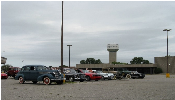
MacDonald's On Old US 231, Lafayette

Note: From US 231 and Indiana 25 head east on Indiana 25 to Old US 231 and turn right. McDonald's will be on the right.