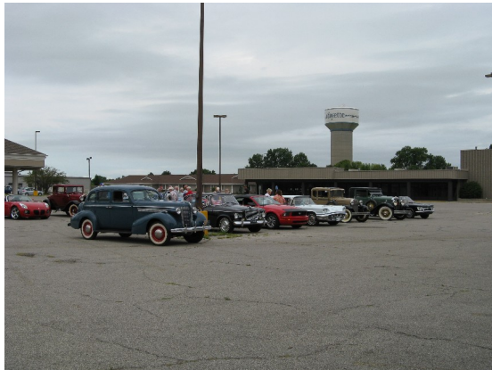
McDonald's on Old US 231, Lafayette

Note: From US 231 and Indiana 25 head east on Indiana 25 to Old US 231 and turn right. McDonald's will be on the right.