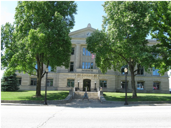
Hendricks County Courthouse, Danville

The Mayberry Cafe is open 11 AM to 9 PM, but it is closed on Mondays.