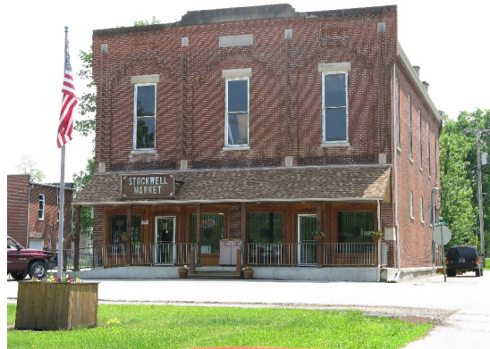
Stockwell Market, Stockwell

At Concord, turn left onto County Road 900 South.