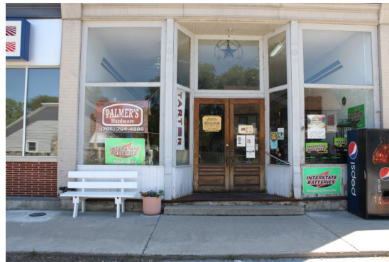
Palmer's Hardware, Darlington

In Darlington, turn right onto Main Street. Main Street contains Palmer's Hardware and the Public Library. We will stop in Darlington for a 30 minute break.