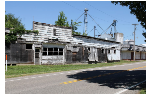
Old Garage, New Ross

Just east of Mace turn left onto US 136.