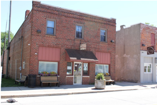
Town Hall, North Salem

At intersection with Indiana 39 turn right onto Indiana 39.