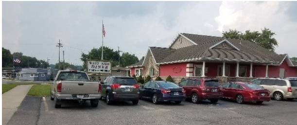
West Side Diner, Logansport

In Logansport at stop sign turn left onto Cicott Street and cross over Wabash River. At stop light turn left onto Market Street. Then, turn right into West Side Diner parking.