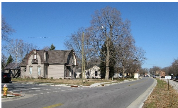
Downtown, Battle Ground

Leave the Memorial turning left onto Railroad Street.