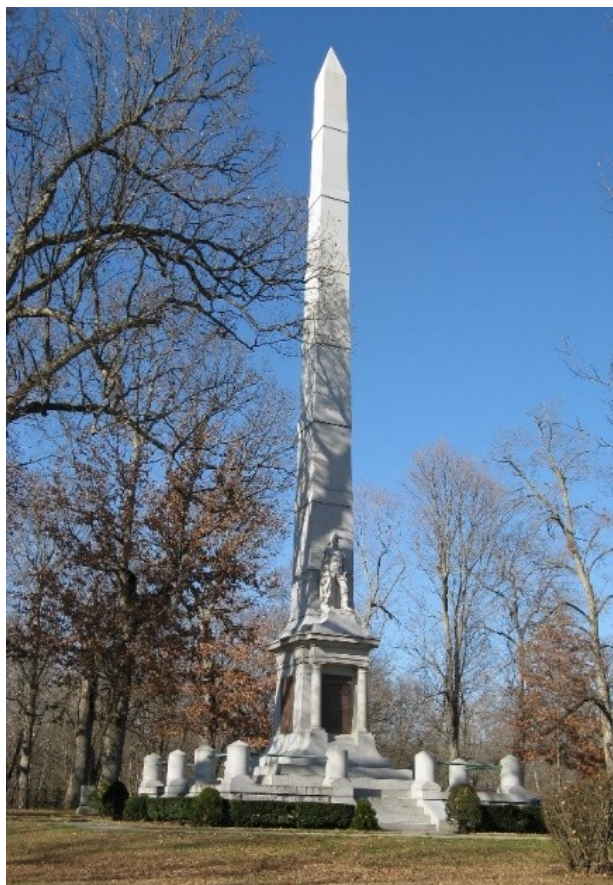
Tippecanoe Battlefield Memorial, Battle Ground

Note: Tippecanoe Battlefield Memorial can be reached by taking Indiana highway 43 north from West Lafayette. About a mile north of Interstate 65 turn right onto Indiana highway 225. At the stop sign in Battle Ground turn right onto Railroad Street. The Memorial will be on your right.