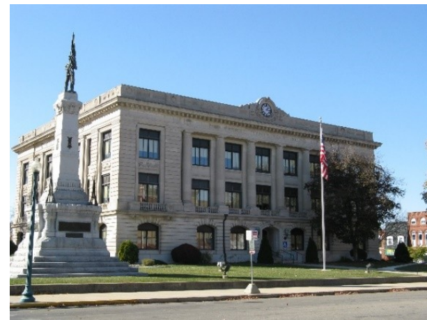
Carroll County Courthouse, Delphi

As you enter Delphi, Bicycle Bridge Road becomes Franklin Street. At stop sign cross over US 421/Indiana 18 and stay on Franklin Street - past courthouse.