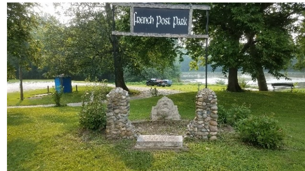
French Post, Lockport

Turn left onto County Road 350 West. Turn right onto County Road 850 North. Road goes by French Post Park (see note at end of directions).