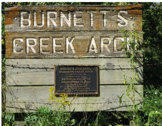
Burnett's Creek Arch, Lockport

Cross over the bridge to Lockport. Turn right onto West Towpath Road. Just past the houses on the left and as you go up an incline is Burnett's Creek Arch, a bridge to take the canal over the creek.