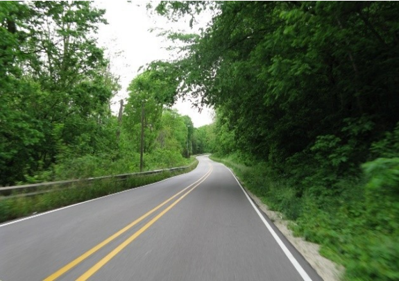
Bicycle Bridge Road, Battle Ground

Return to Main Street and turn left. Turn left onto Tyler Road. Turn right onto Bicycle Bridge Road.