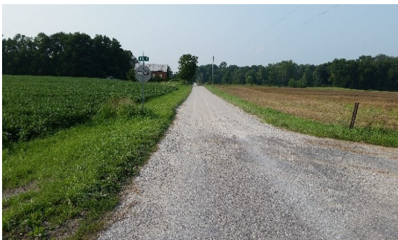
District No. 4 Schoolhouse, Delphi

Turn left onto County Road 350 West. Just before turning right onto County Road 850 North if you look straight ahead down the gravel road there is the District No. 4 schoolhouse, built 1895.