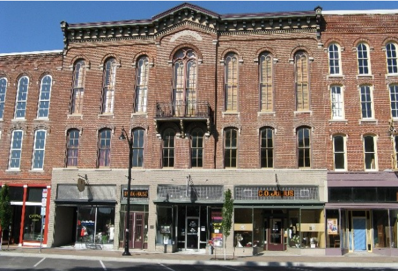
Opera House, Delphi

On the east side of the courthouse square is the Opera House on South Washington Street.