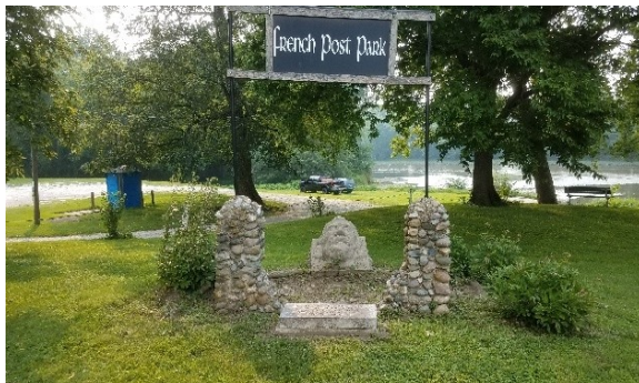
French Post Park, Lockport