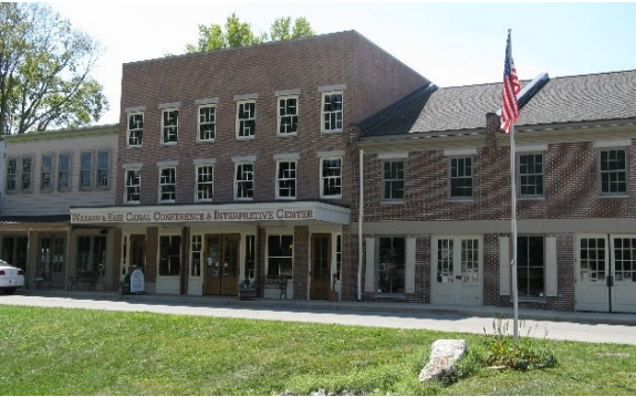
Wabash and Erie Canal Museum, Delphi

Return to Franklin Street and turn left. Turn left onto Wilson Street which becomes Carrolton Road. Continue north and east out of town.