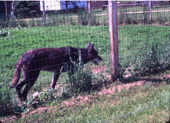
Wolf Park, Battle Ground

At Jefferson Street turn left and head north out of town. Turn right onto County Road East 800 North. At the end of the road is Wolf Park.