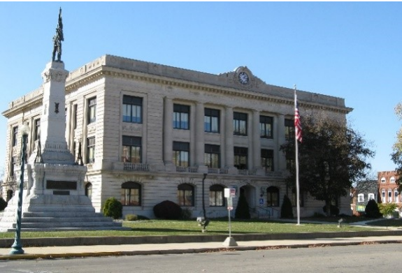
Carroll County Courthouse, Delphi

As you enter Delphi, Bicycle Bridge Road becomes Franklin Street. At stop sign cross over US 421/Indiana 18 and stay on Franklin Street - past courthouse.