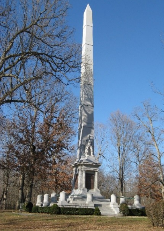
Tippecanoe Battlefield Memorial, Battle Ground

Note: Tippecanoe Battlefield Memorial can be reached by taking Indiana highway 43 north from Interstate 65 in West Lafayette. About a mile north turn right onto Indiana highway 225. At the stop sign in Battle Ground turn right onto Railroad Street. The Memorial will be on your right.