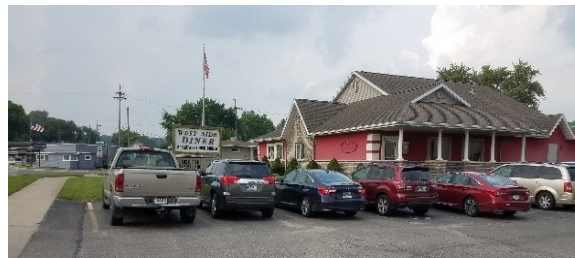
West Side Diner, Logansport

In Logansport at stop sign turn left onto Cicott Street and cross over Wabash River. At stop light turn left onto Market Street. In about a quarter mile is the West Side Diner.