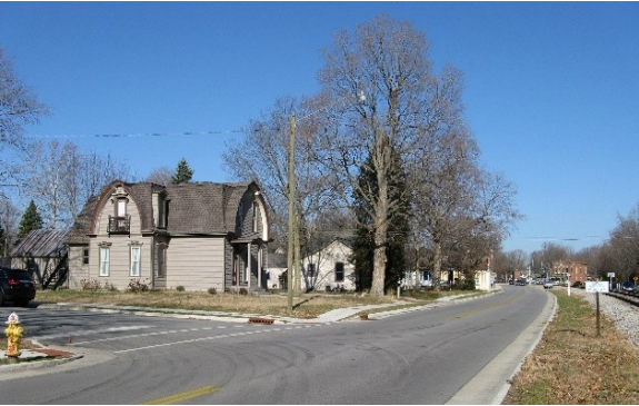
Downtown, Battle Ground

Leave the Memorial turning left onto Railroad Street.