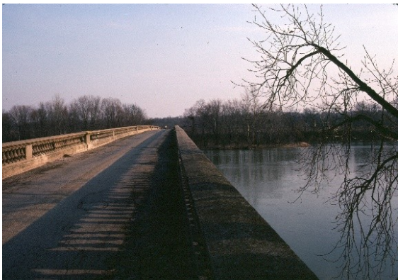
Carrollton Bridge, Delphi

Return to County Road 675 North and continue east.