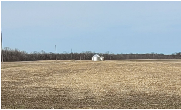
Grain Bins, Monon

At US 421 turn right and then, turn left into the parking lot for the Whistle Stop Restaurant and Monon Connection Museum.