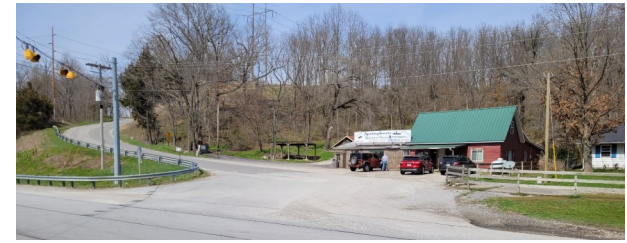
Springboro General Store, Brookston

Turn left onto Tyler Road. Continue north on Tyler Road. Cross Indiana 18. (Tyler Road becomes Springboro Road.)