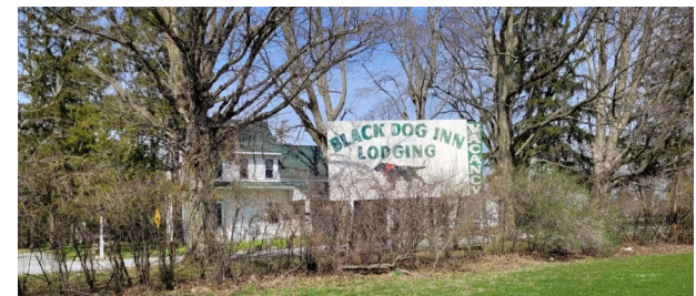
Black Dog Inn, Monticello

In Monticello 6 th Street becomes Shafer Drive.