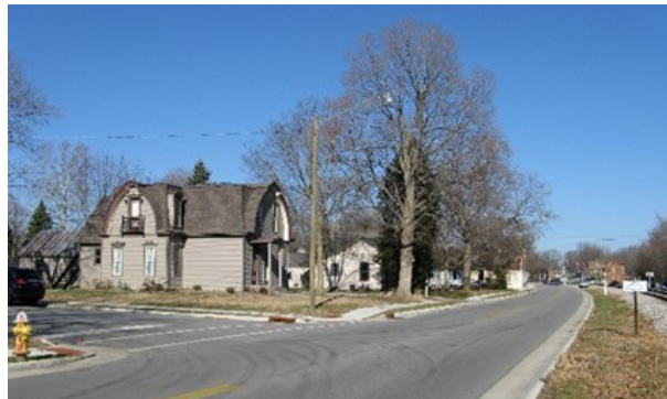
Downtown, Battle Ground

Leave the Memorial turn left onto Railroad Street.