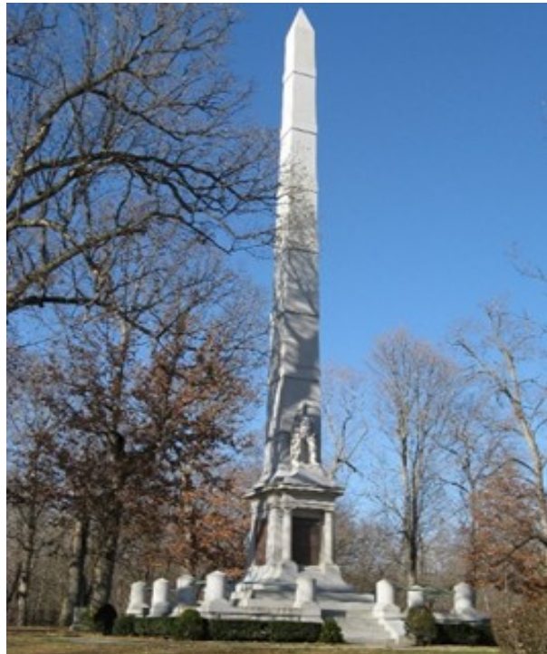
Tippecanoe Battlefield Memorial, Battle Ground

225. At the stop sign in Battle Ground turn right onto Railroad Street. The Memorial will be on your right.