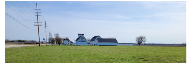
Hubbard Farms, Monticello

In Monticello Freeman Road becomes 6 th Street. Cross over US 421 and continue north on 6 th Street.