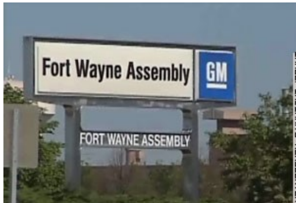
GM Fort Wayne Assembly Plant, Roanoke

Continue on US 24 to Huntington. Sharp left turn to stay on US 24 around Huntington.