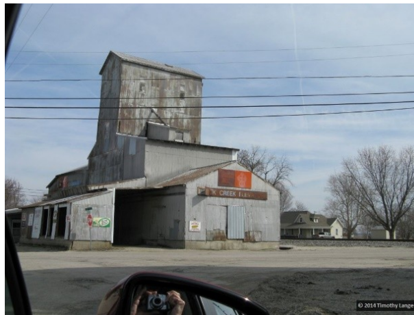
Buck Creek Elevator, Buck Creek

Head north on County Road 750 East from the school to the town of Buck Creek. Go straight through town to the stop sign at Indiana 25 (Hoosier Heartland Highway). Turn right on Indiana 25.