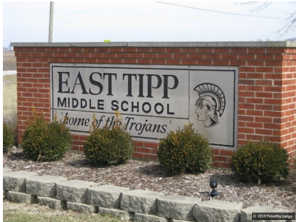
East Tipp Middle School, Buck Creek

Note: East Tipp Middle School is located 3.5 miles east of Indiana 25 on County Road 300 North, Lafayette. Please park in the northwest corner of the parking lot. We will car pool to make it easier to stay together.